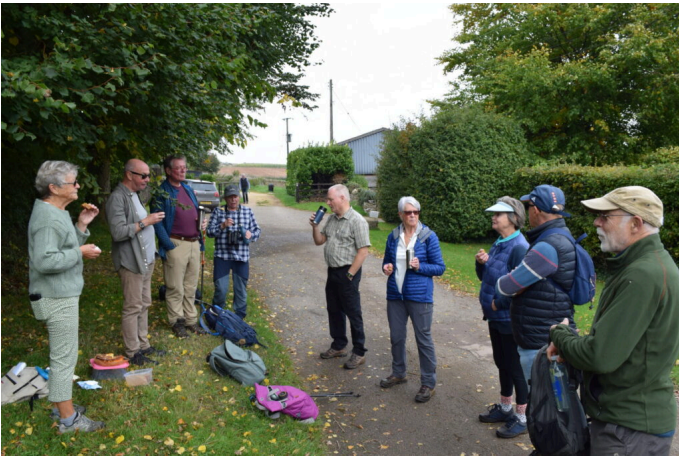
Let there be cake