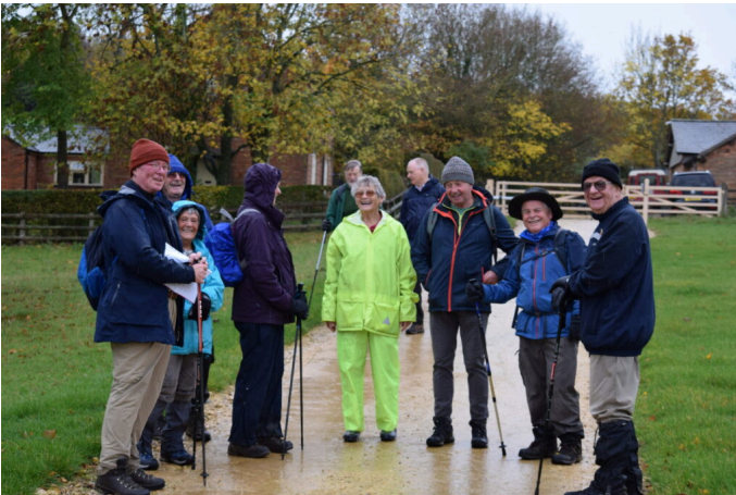
A bright light on a dull day

Lunch and refreshments were partaken of by some at the Plough.