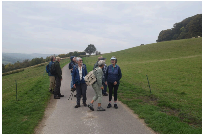
Having a laugh - Winchcombe 2nd Oct 25

Their Next Walk will be on Thursday 6th November, when a walk beginning at Sibford Gower is planned.