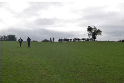
Going up the Hill at Todenham 8th Oct 25

On Wednesday 8th October a large group met at the Alain Rouveure Nepal centre to walk ' Todenham and the Lost Ditchfords '