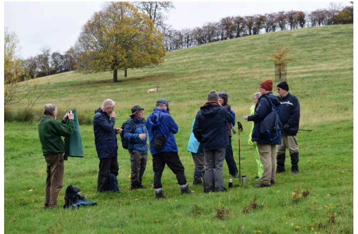
Walking with the sheep starting at Stretton

The 5-Milers' first walk in November will take place on Wednesday 12th November.